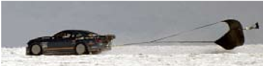
Danny Thompson, left, drove a limited production 2008 FR500C Mustang to 252 miles per hour at Bonneville Salt Flats in Utah.